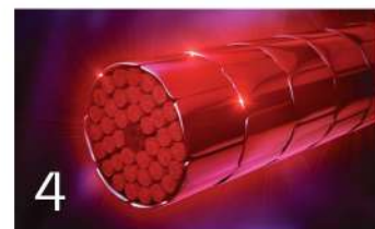
The result: True Color in High Definition