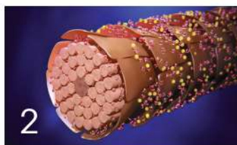
Lipid carriers for amplified penetration