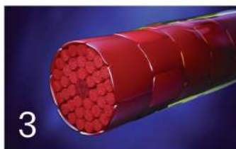
Perfect sealing for retention